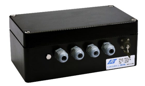
Model ESDL-30 automatic datalogger for SDI-12 digital interface sensors

EAN-42M-X —Length of beam (with SDI-12 digital interface)