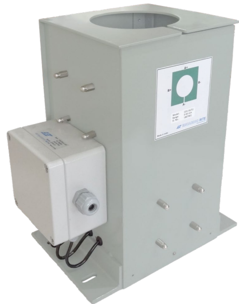
Model EPR-01S automatic readout unit

The device is constructed from stainless steel and is maintenance free, designed to work in hostile environment. Installation is simple and quick.