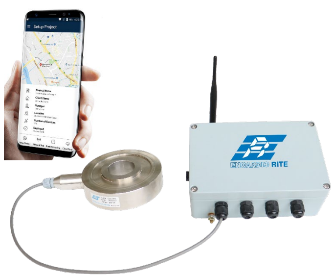
Resistive strain gage type center hole load cell connected to model EWN-04A analog node

The node is tested in terms of its measurement precision and its wireless communication performance. It is housed in a rugged enclosure designed for use in harsh environments with wide temperature tolerance with resistance to moisture and humidity.