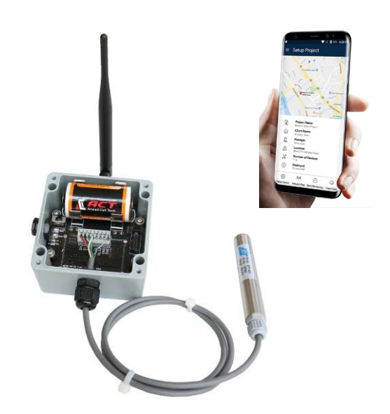
Vibrating wire piezometer connected to node

The application provides step-by-step instructions and displays whether the radio signals or battery strength is good enough.